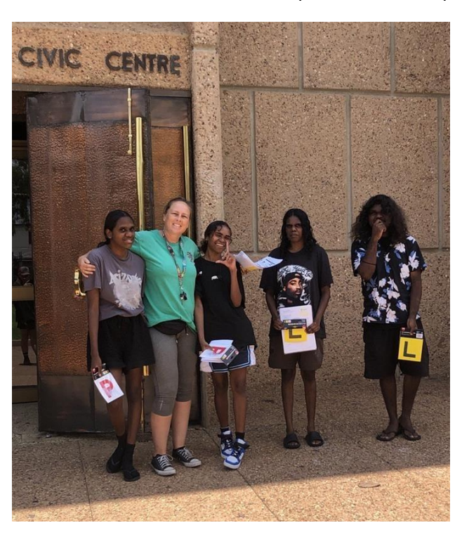
1 - Learners license

During term 4 we continued to meet our goals of ensuring our Young People had access to education and training provided by Mount Isa businesses and community. Over term 4 we had many students engage in accredited course that will help them with employment in the future.