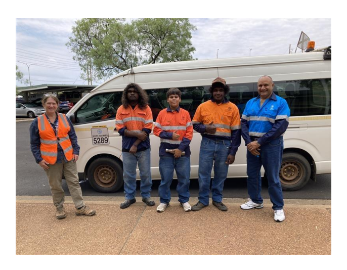
2 - Glencore Tour