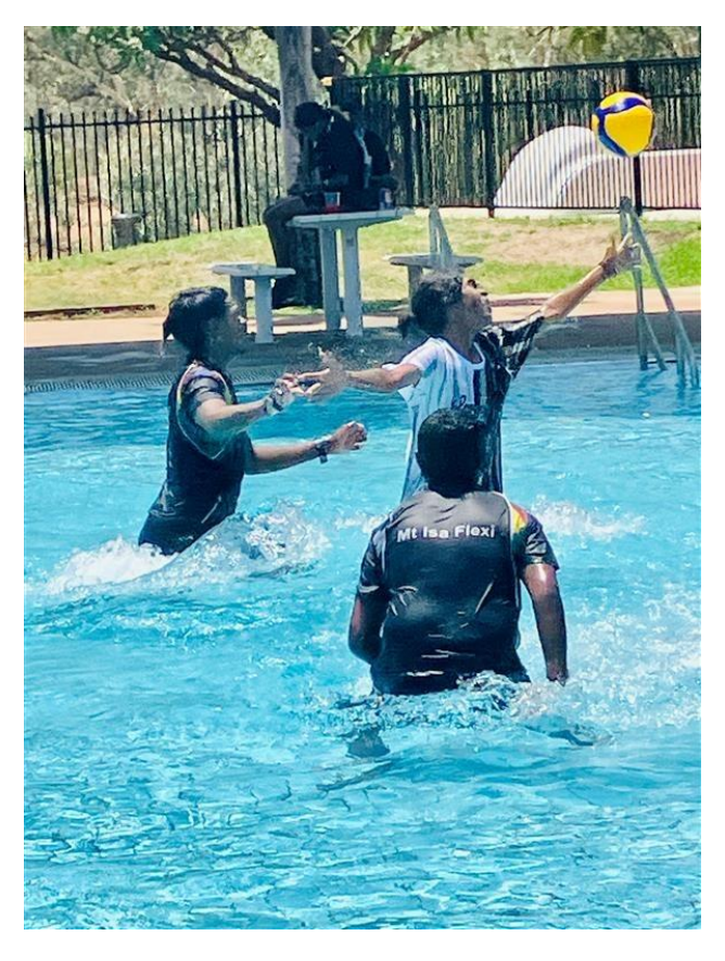
12 - Swimming

In Term4 Kanga, Emu and Dingo classes participated in Gregory Camp. A two night camp designed to learn about camping, cooking, fishing and outdoor adventure sports.