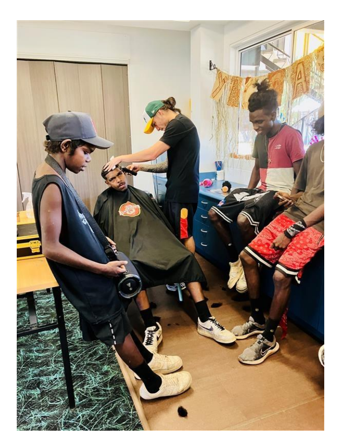
16 - hairdressing