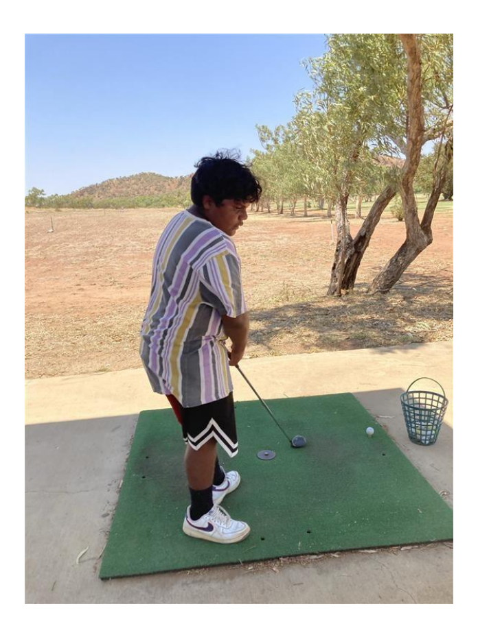
9 - golf