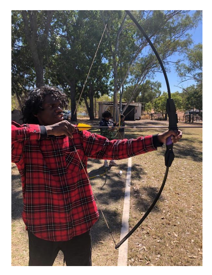
4 - archery