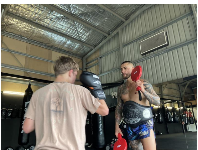
6 - Mauy Thai