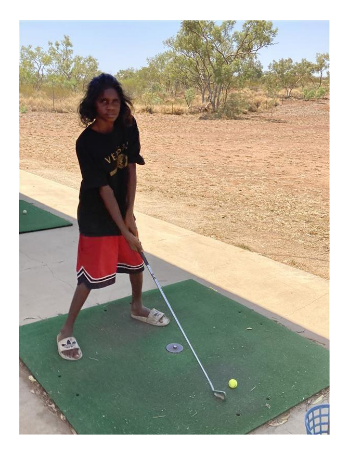
7 - Golf