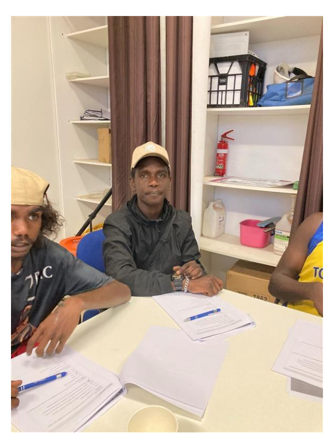
3 - White card - Contruction

In term 4 both classes participated in basketball, swimming, Mauy Thai \, and golf programs to keep our brains both fit and healthy, while promoting team work .