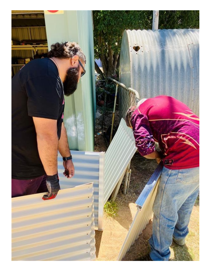
17 - Building