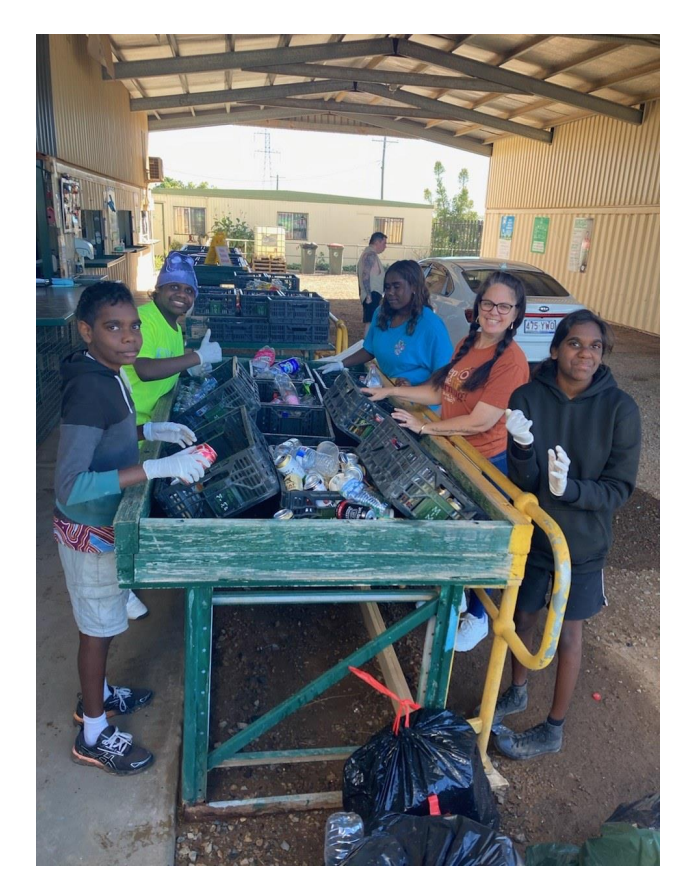
13 - sorting