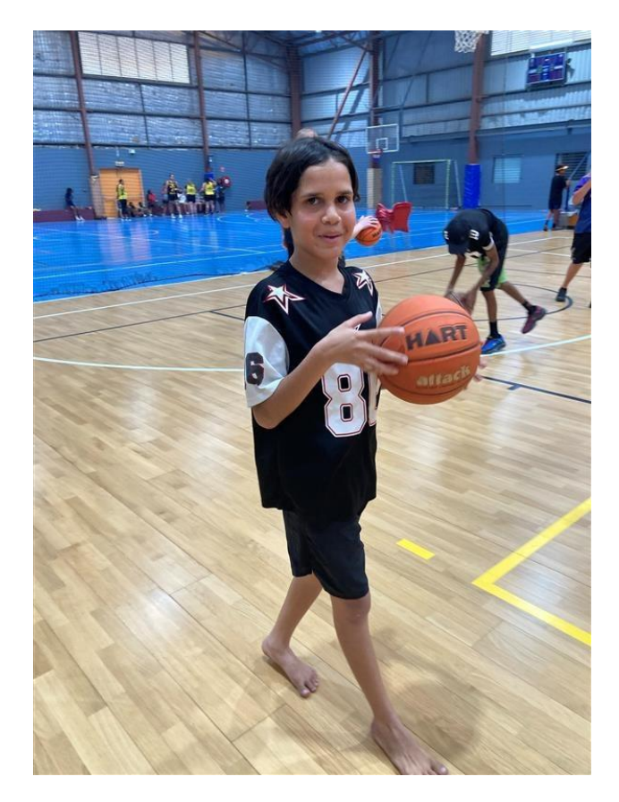
10 - basketball