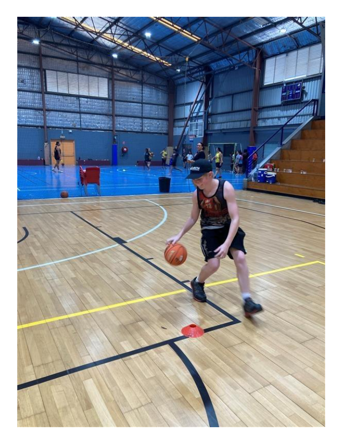
5 - basktball