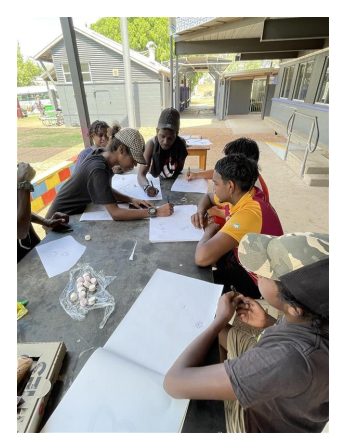
14 - Outside