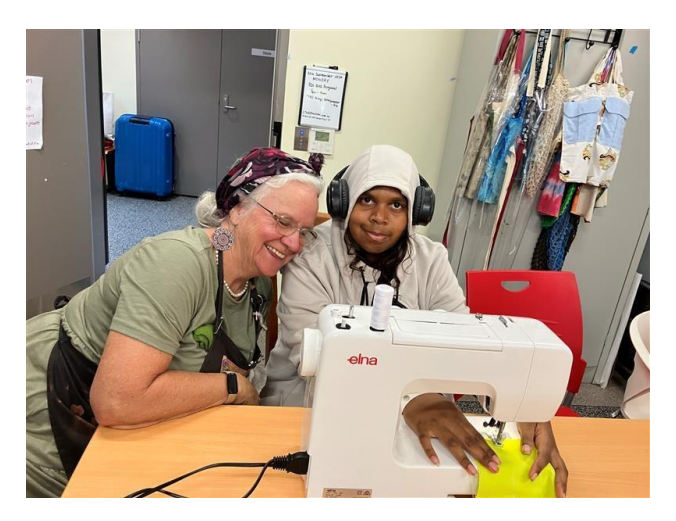
15 - sewing

Expressing yourself through Art and creative projects is another way we learn at school. Art helps create a calm space in your mind.